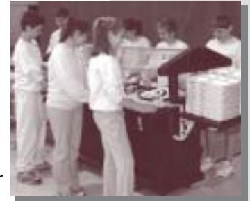
Daily hot lunch available